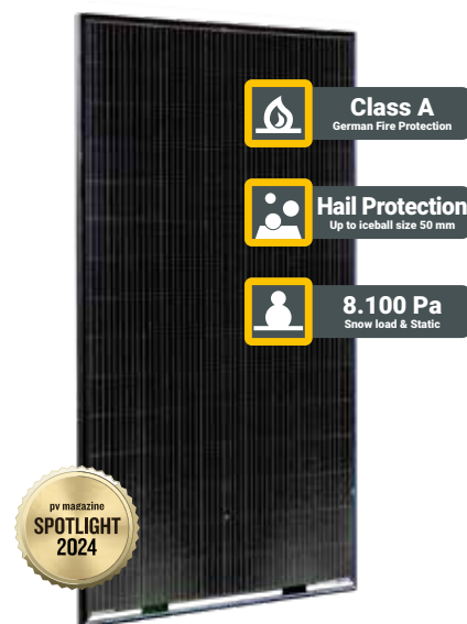
Mono S5 Halfcut | Installer Series

„Maximum flexibility for existing buildings and repowering “